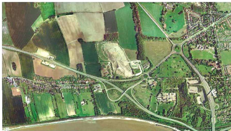
Proposed Humberfield Site