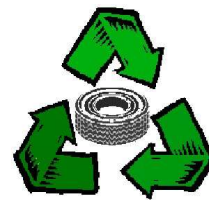
Recycling Waste Tyres

Our experts are able to balance the inevitable negative aspects of waste management with essential community needs.