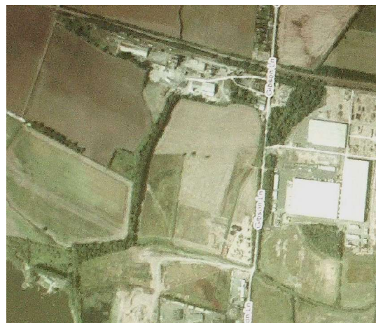
Transwaste Melton (Under construction)

On occasion disagreements arise concerning controversial developments; this can lead to Planning Appeals and Public Inquiries. A & F are able to assist clients in presenting their concerns in a legal context.